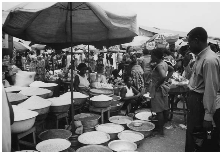
Farmers still supply about 90% of the seed that is planted on the continent, but a number of regional initiatives are afoot to change all that.