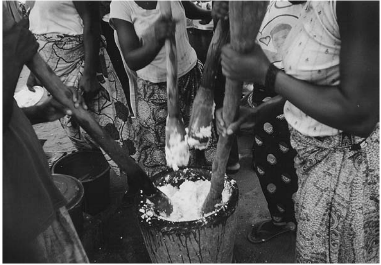
African farmers have a long history of working together. This may be their greatest strength in their bid to keep alive their seed and their farming systems

Realistically, African farmers will continue to supply the bulk of the continent's seed needs for some time to come. But the cruel irony is that the combination of new seed regulations, intellectual property laws and cutting edge technologies like genetic engineering will continue to marginalise them. So increasingly, Africa's seeds systems will be split into two disjointed realities: a privatised,