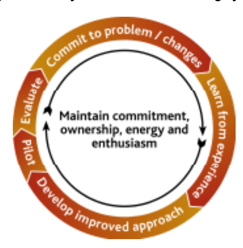
Figure 2: Khanya-aicdd's action learning cycle

Core to our work is promoting action learning partnerships across Africa. The reality is that there is a lot of experience that can be drawn on but this doesn't always happen. Our approach is about learning together to make the world a better place.