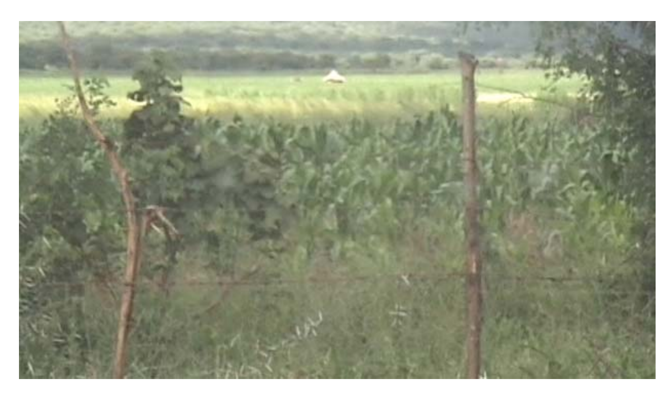
Photo four : late crops – and fallow fields in a different ARDA-run Matabeleland irrigation scheme (March 2006). Maize should be two metres high by March.