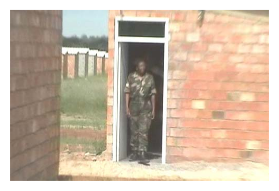
Photo two : soldier emerges from a newly allocated house in Cowdray Park, where 700 houses were built under Operation Garikai / Hlalani Kuhle, supposedly for the displaced.