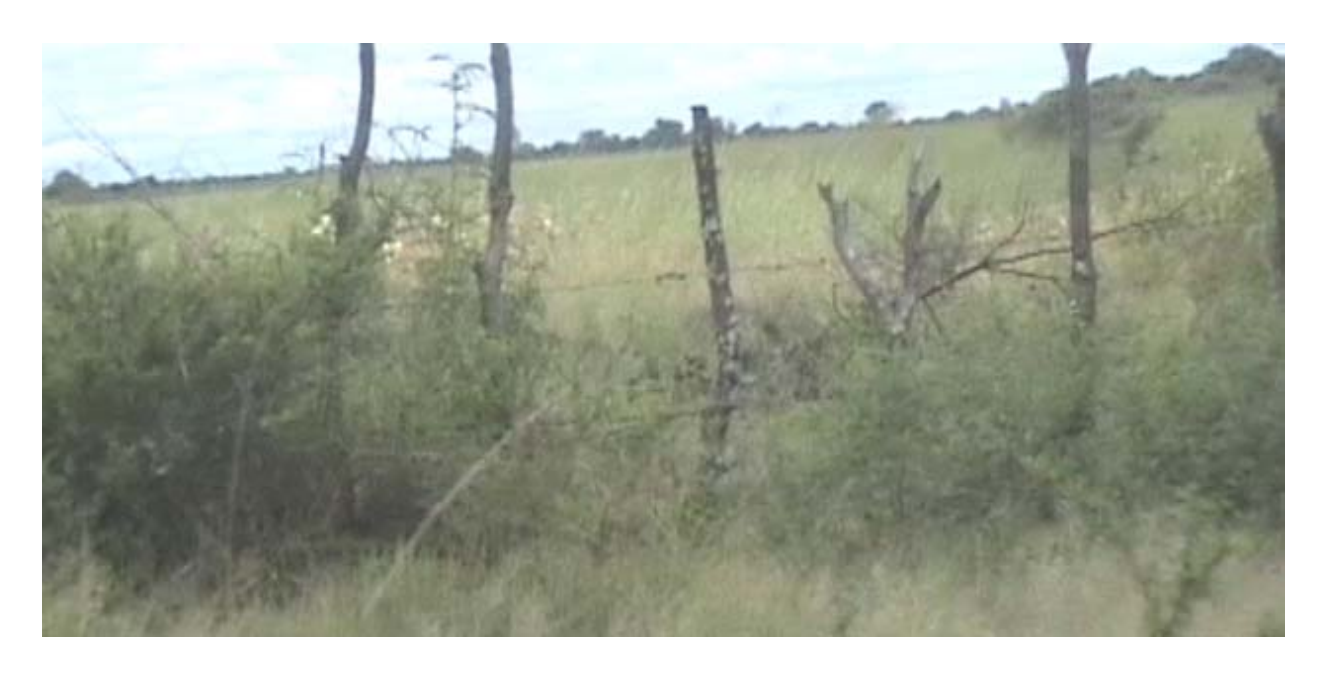
Photo three : tall grass waves in fallow fields where maize should be growing, in an ARDA-run irrigation scheme in Matabeleland (March 2006)