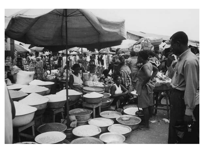
Farmers still supply about 90% of the seed that is planted on the continent, but a number of regional initiatives are afoot to change all that.

A regional trade body that brings together Angola, Botswana, the Republic of Congo, Lesotho, Malawi, Mauritius, Mozambique, Namibia, Seychelles, South Africa, Swaziland, Tanzania, Zambia