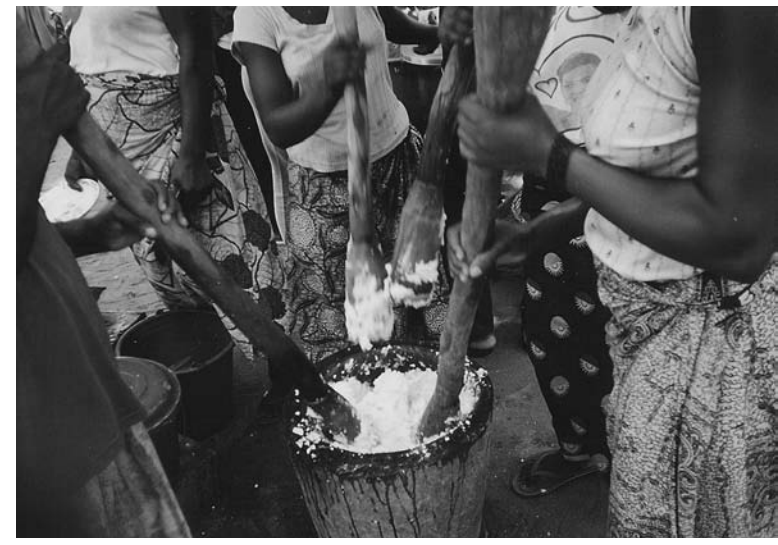
Aftican farmers have a long history of working together. This may be their greatest strength in their bid to keep alive their seed and their farming systems

Realistically, African farmers will continue to supply the bulk of the continent's seed needs for some time to come. But the cruel irony is that the combination of new seed regulations, intellectual property laws and cutting edge technologies like genetic engineering will continue to marginalise them. So increasingly, Africa's seeds systems will be split into two disjointed realities: a privatised,