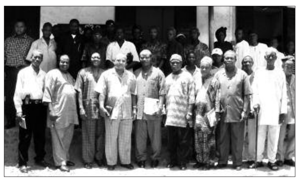
Gola forests chiefs at project meeting

and water-holding capacity. Water is a clear constraint in many rains-fed systems. When water is better harvested and conserved, it may be the key factor leading to improved agricultural productivity. Provided the soil's nutrient balance is maintained, better water management means better cropping.