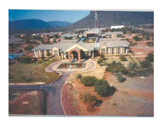
Police College - OTSE

vehicle. These figures include motorcycles, buses of all sizes, recovery vehicles and trucks.