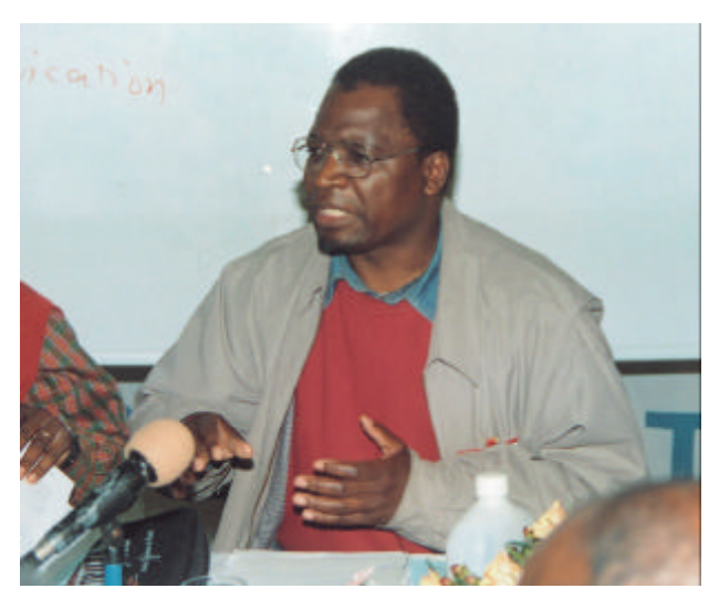
Professor Lloyd Sachikonye

Zanu PF abandoned this approach when it calculated that it faced the prospect of an electoral defeat in the 2000 election. In its place, a new radical, opportunistic and chaotic approach was adopted to pre-empt such a defeat. Scores of farm workers, farmers and opposition party supporters were killed, and hundreds injured in the violence that ensued between 2000 and 2002. The situation remains unsettled today as land invasions or threats of invasions continue. Dialogue with key stake-holders such as the Commercial Farmers Union, the General Agricultural and Plantation Workers Union of